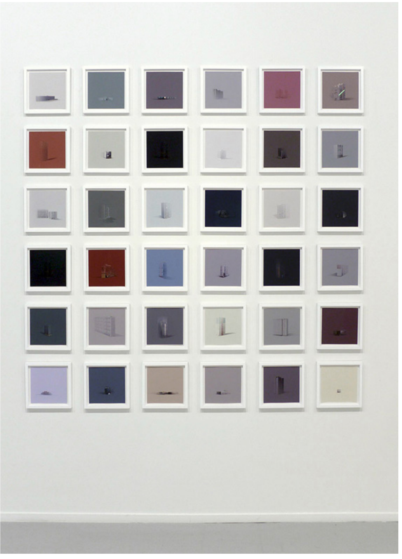
FTL - Tri-Postal | photo : © Olivier Nordl 2014