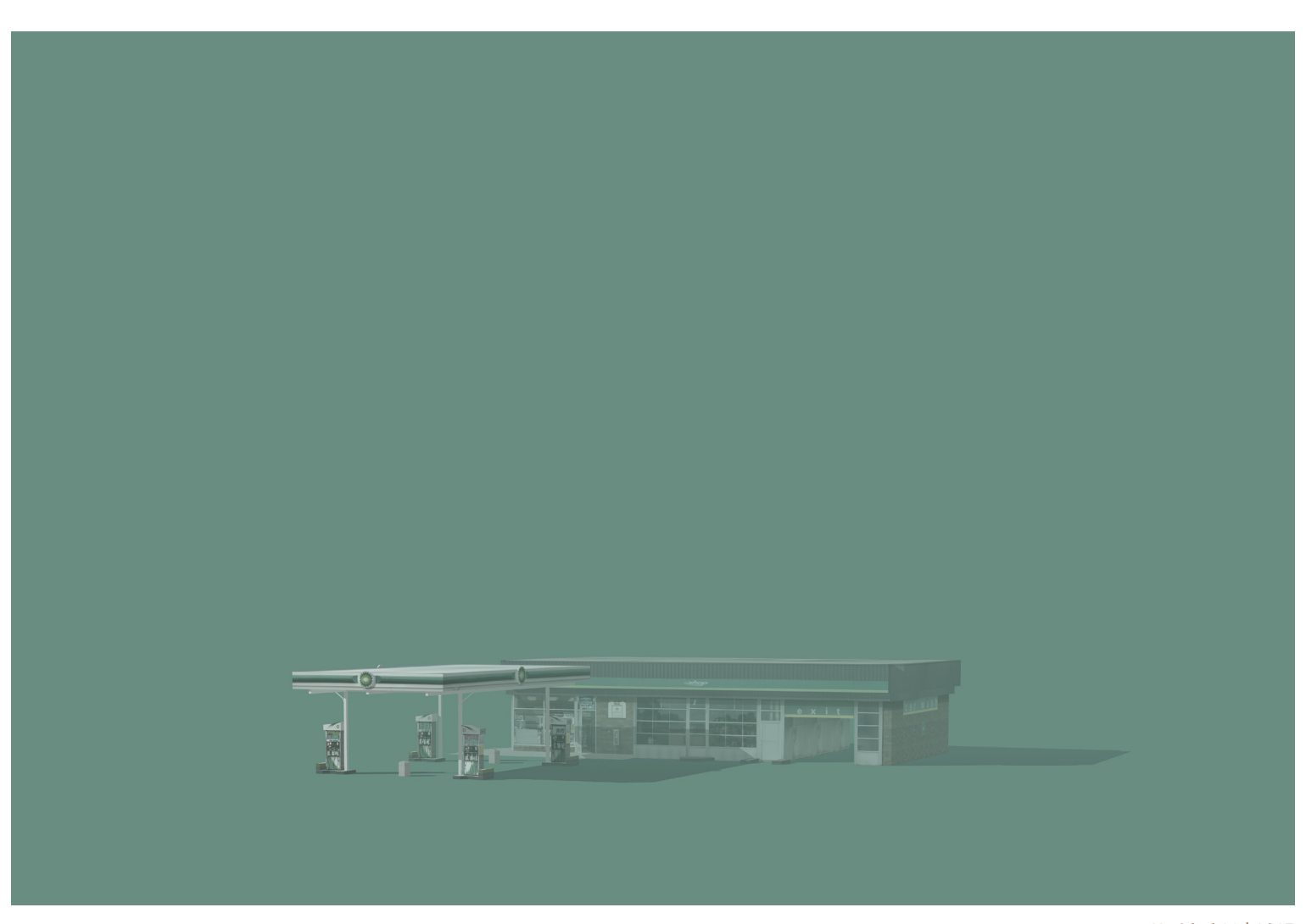
Untitled 88 | 2023